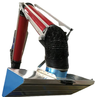
MAXIRET hood on 200mm arm