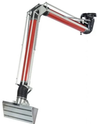
MAXIRET hood on arm without extractor