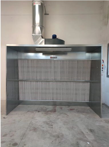
Example of spray booth installation with extensions and roof, complete with lights and control panel (WFPX)